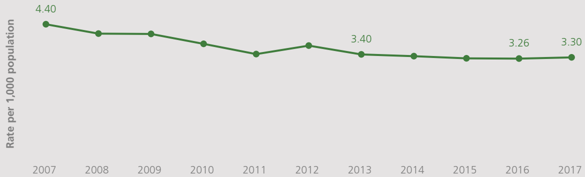
Figure 1 Annualized violent crime rate mid-year 2007-2017

NOTE: The violent crime rate includes reported homicides, rapes, robberies, and aggravated assaults.