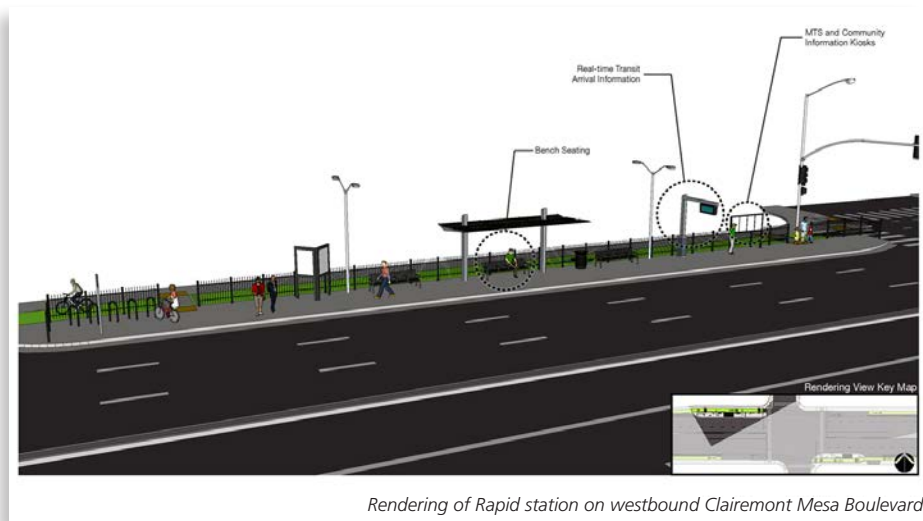
Rendering of Rapid station on westbound Clairemont Mesa Boulevard