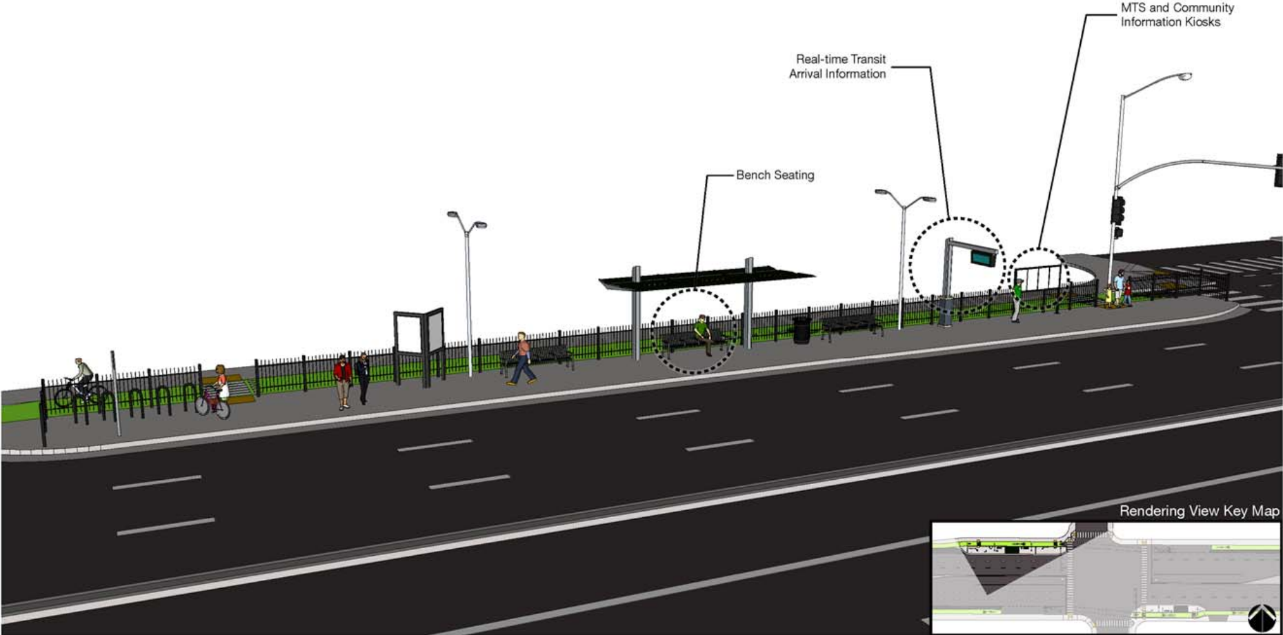
Westbound Station Facing North