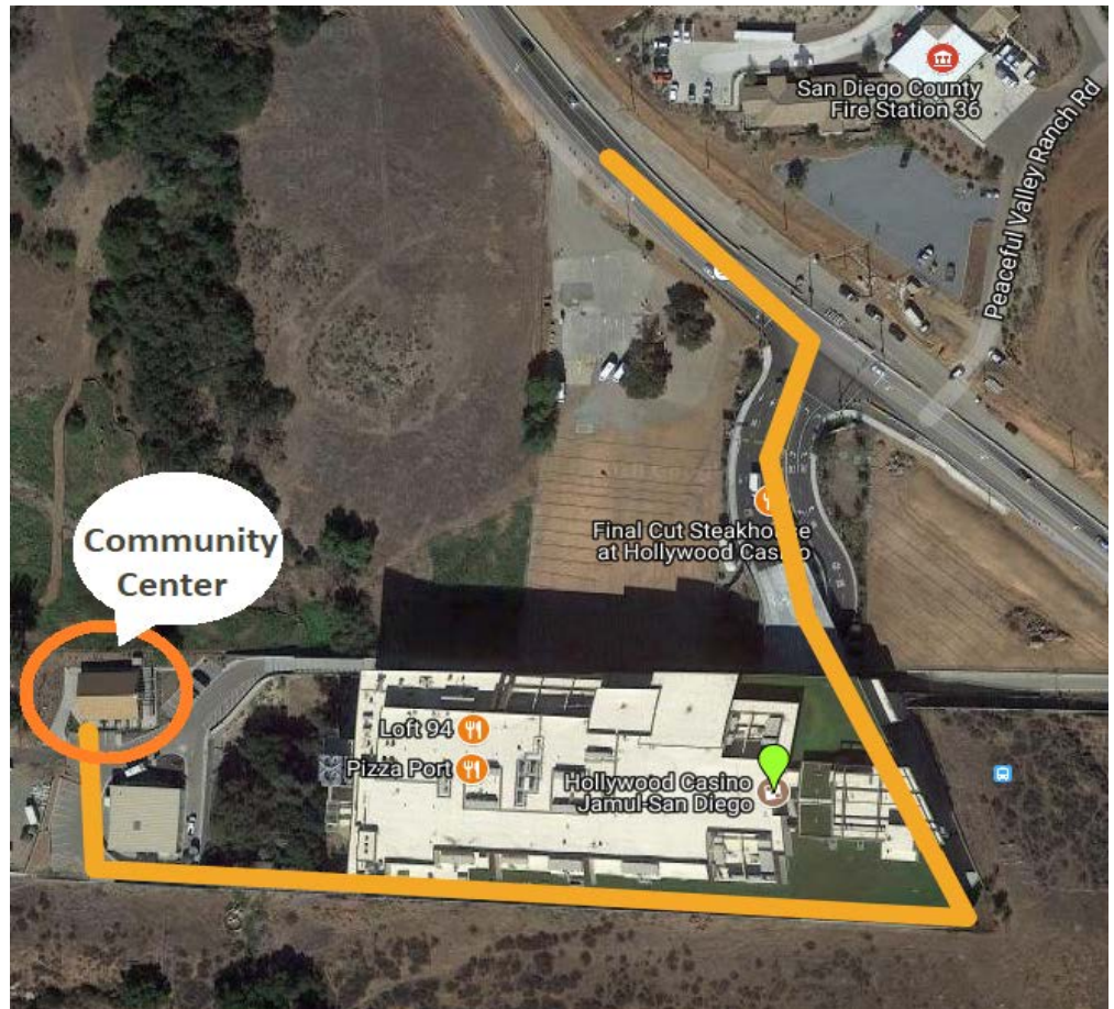
Figure 2 – Directions to Jamul Community Center