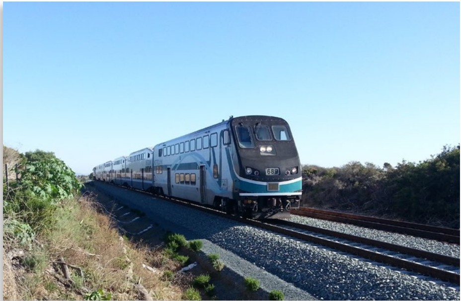
The first stage of construction added 4.2-miles of second track from San Onofre State Park to Las Flores Creek on Camp Pendleton.

the LOSSAN corridor, including a primary effort to double track the corridor from Orange County to Downtown San Diego. To date, more than 60 percent of the San Diego segment has been double tracked, which allows two trains traveling in opposite directions to pass without slowing down or stopping, increasing efficiency and reliability. By 2030, more than 97 percent of the corridor is expected to be double tracked. Other infrastructure improvements include bridge and track replacements, new platforms, pedestrian crossings, and other safety and operational enhancements.