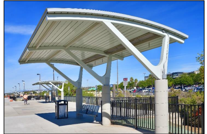
A photo of a new overhead canopy at Poinsettia Station.