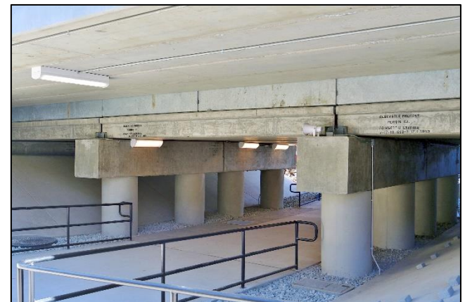
A photo of the new pedestrian undercrossing at Poinsettia Station.