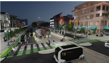
Conceptual rendering of connected, multimodal transportation options