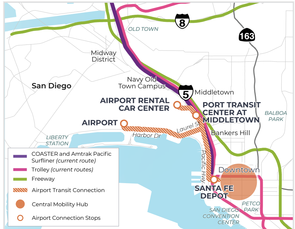
Proposed Central Mobility Hub and airport transit connections

The Santa Fe Depot is located on Pacific Highway, near the North Embarcadero. The transit connection between the airport and Santa Fe Depot would provide a critical link to San Diego's urban core and make travel to the airport more convenient for anyone who lives in, works in, or visits Downtown San Diego.