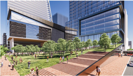
Conceptual rendering of the Central Mobility Hub