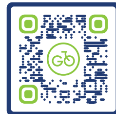
(Project map on reverse page)

Visit KeepSanDiegoMoving.com/PershingBikeway or contact the SANDAG GO by BIKE Team at GObyBIKE@sandag.org or on our toll-free hotline: (833) 899-BIKE (2453).