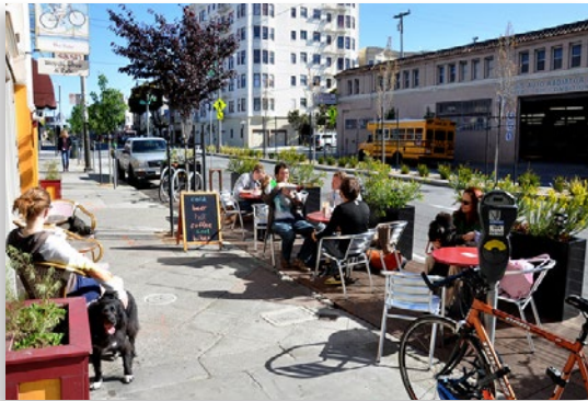
Bikeways help create vibrant public spaces and enhance neighborhood character.