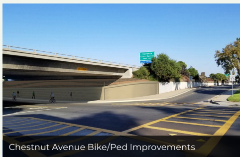
Chestnut Avenue Bike/Ped Improvements

Separated bike and pedestrian paths were constructed at the Interstate 5 (I-5) interchanges at Santa Fe Drive and Encinitas Boulevard in Encinitas, and similar improvements will be constructed at Chestnut Avenue in Carlsbad. These enhancements help improve east-west connectivity and safety for people walking and biking to nearby schools, activity centers, and coastal resources. Community artwork is being incorporated in coordination with the cities.