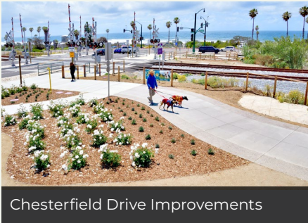
Chesterfield Drive Improvements

New coastal access improvements have been completed along the Los Angeles-San Diego-San Luis Obispo (LOSSAN) rail line. These include a pedestrian rail undercrossing at the southern end of the San Elijo Lagoon and the redesigned at-grade rail crossing located at Chesterfield Drive. Both projects allow pedestrians to safely cross the rail line and expand coastal access within the Cardiff-by-the-Sea community. The Chesterfield Drive improvements also allowed the City of Encinitas to obtain a Quiet Zone designation at the rail crossing, eliminating a requirement for train engineers to sound the horn when approaching the at-grade crossing.