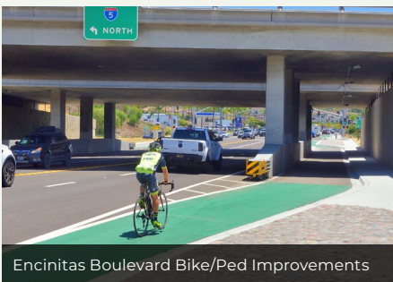
Encinitas Boulevard Bike/Ped Improvements