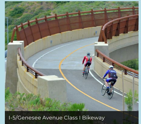
I-5/Genesee Avenue Class I Bikeway

Another critical North Coast Corridor mobility project includes a new 1.5-mile stretch of protected Class I bikeway, along the west side of I-5, connecting the Sorrento Valley Transit Station to major employment hubs in the San Diego communities of La Jolla and University City. This new section of bikeway, completed in 2018, was critical to closing a gap in the greater regional bike network, allowing bikers to now travel unimpeded between Mission Bay and State Route 56 (SR 56).