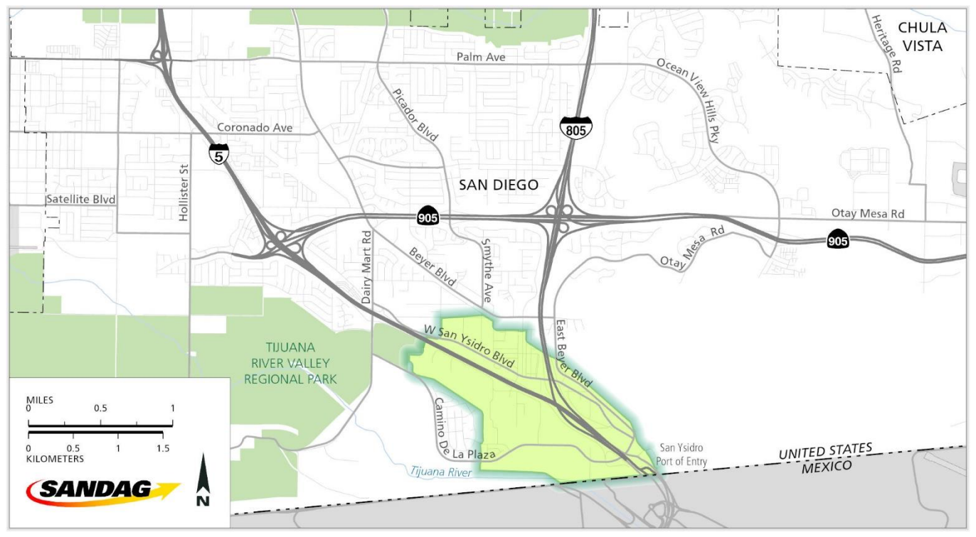
Map 1 San Ysidro employment center