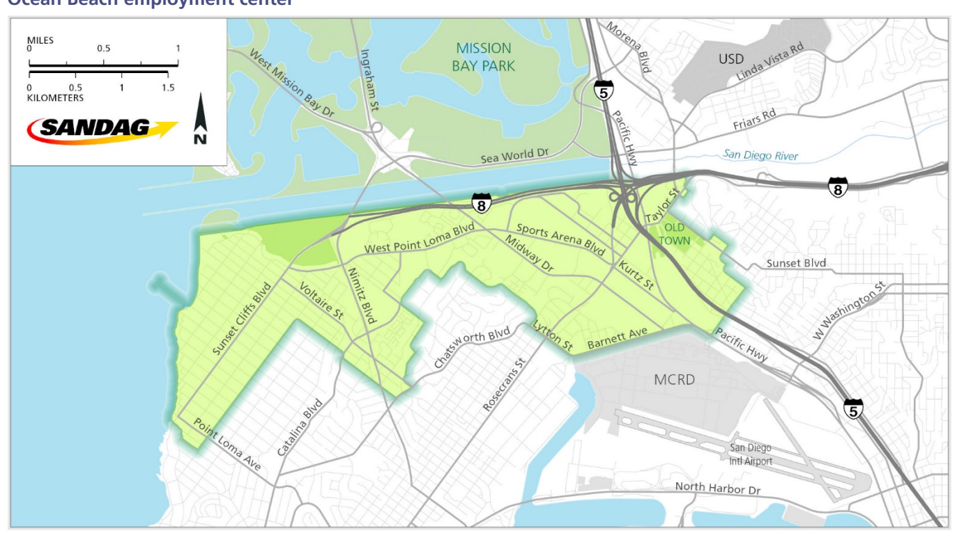
Map 1 Ocean Beach employment center