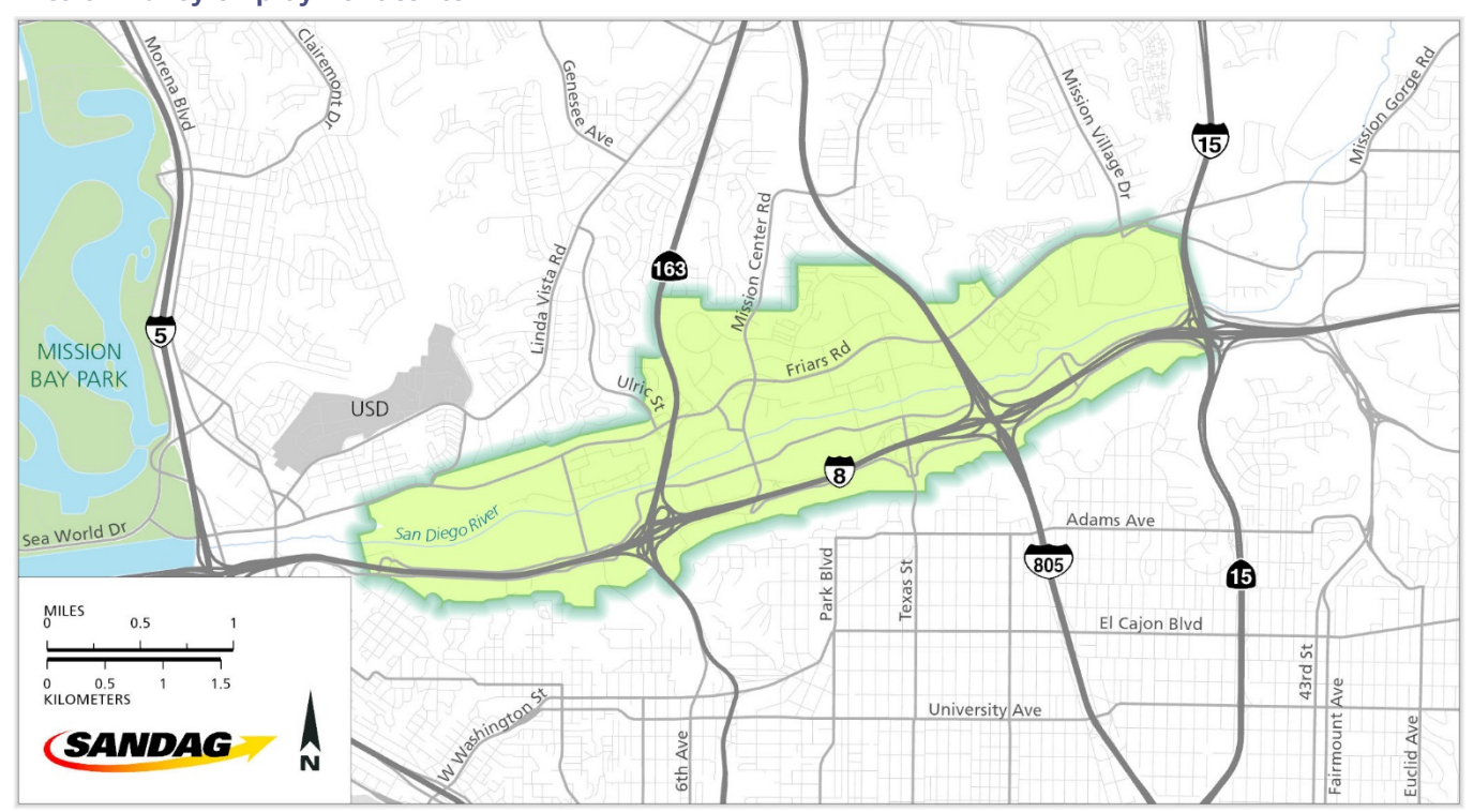
Map 1 Mission Valley employment center