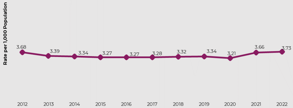
Figure 1 Annualized violent crime rate mid-year 2012-2022

NOTES: The violent crime rate includes reported homicides, rapes, robberies, and aggravated assault. SOURCES: SANDAG, SANDAG Population and Housing Estimates, v2021