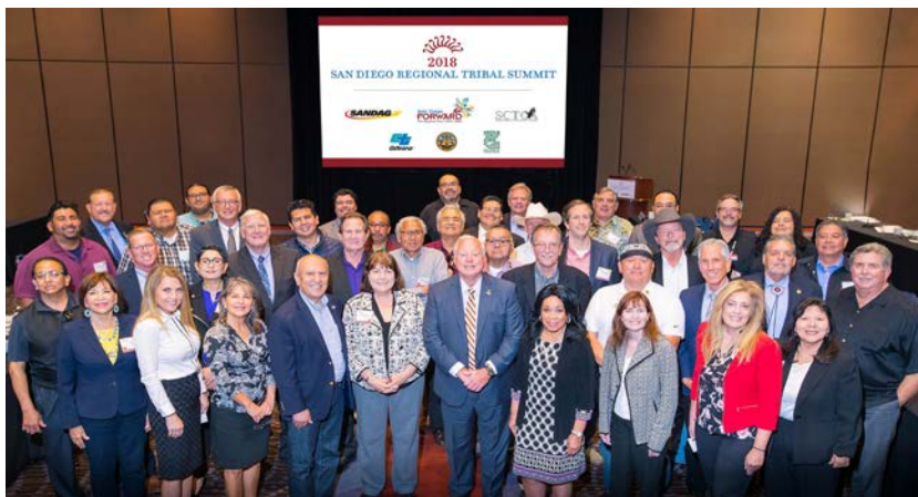
2018 San Diego Regional Tribal Summit