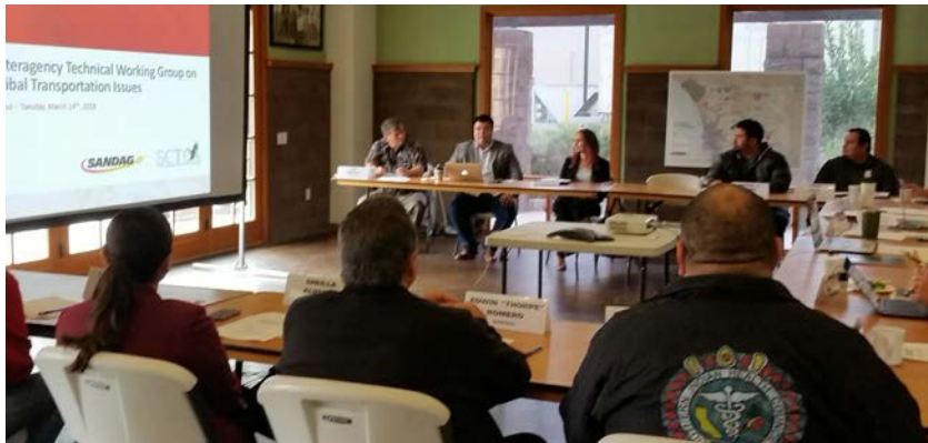
Interagency Technical Working Group on Tribal Transportation Issues meeting at the Jamul Tribal Hall.